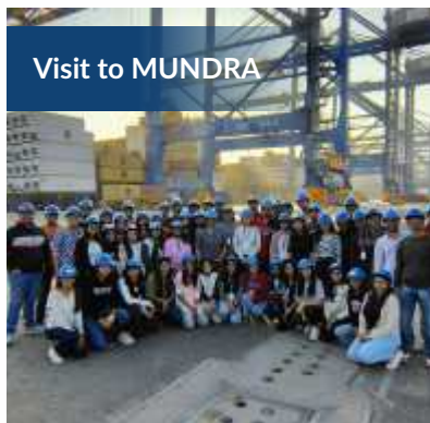
Visit to MUNDRA