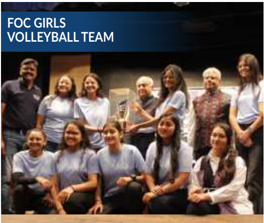
FOC GIRLS VOLLEYBALL TEAM