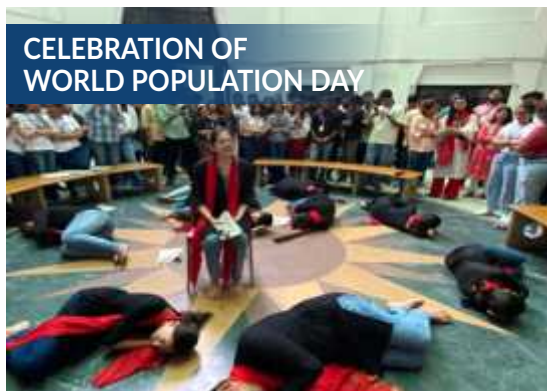
CELEBRATION OF WORLD POPULATION DAY