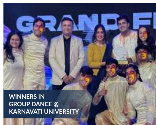
WINNERS IN GROUP DANCE @ KARNAVATI UNIVERSITY