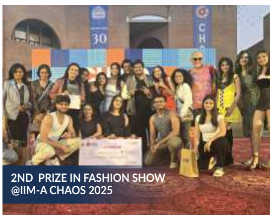
2ND PRIZE IN FASHION SHOW @IIM-A CHAOS 2025