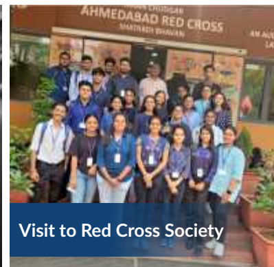
Visit to Red Cross Society