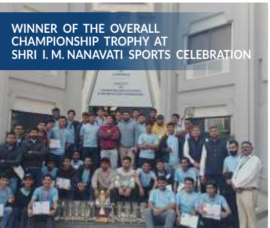
WINNER OF THE OVERALL CHAMPIONSHIP TROPHY AT SHRI I. M. NANAVATI SPORTS CELEBRATION