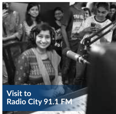
Visit to Radio City 91.1 FM