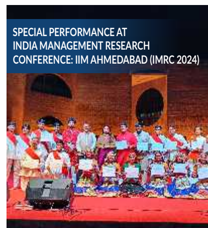
SPECIAL PERFORMANCE AT INDIA MANAGEMENT RESEARCH CONFERENCE: IIM AHMEDABAD (IMRC 2024)