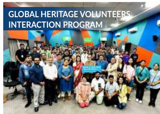
GLOBAL HERITAGE VOLUNTEERS INTERACTION PROGRAM