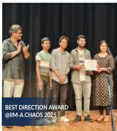
BEST DIRECTION AWARD @IIM-A CHAOS 2025