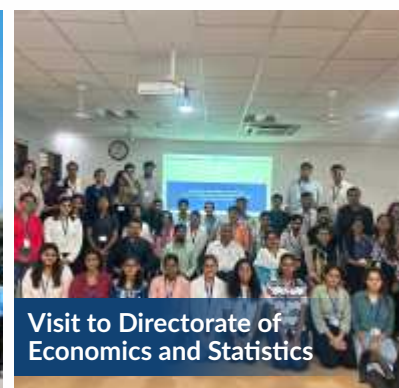
Visit to Directorate of Economics and Statistics