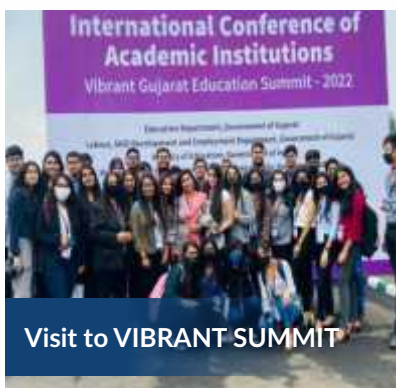
Visit to VIBRANT SUMMIT