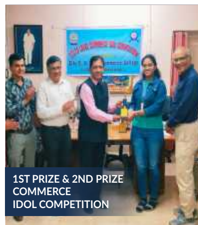
1ST PRIZE & 2ND PRIZE COMMERCE IDOL COMPETITION