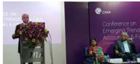
INTERNATIONAL CONFERENCE @ SRILANKA