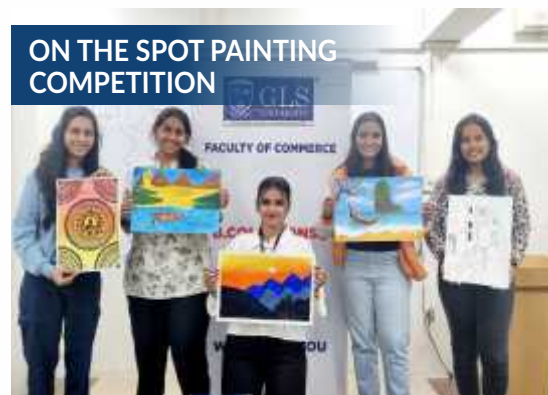
ON THE SPOT PAINTING COMPETITION