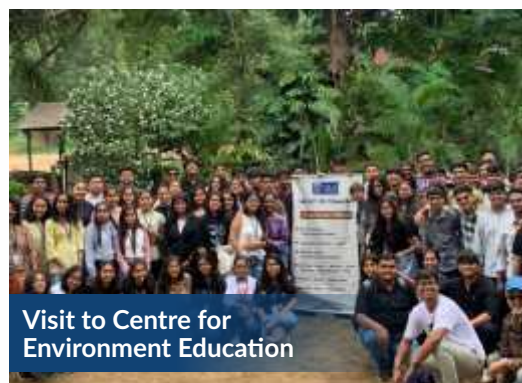
Visit to Centre for Environment Education