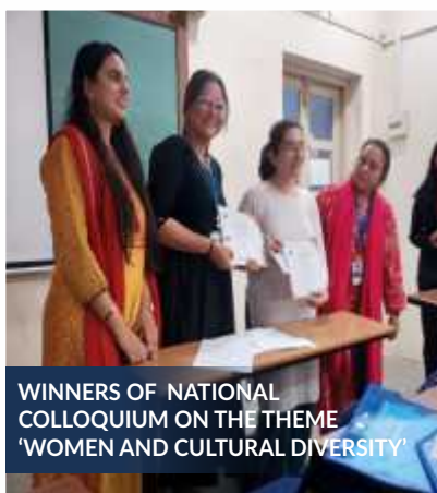
WINNERS OF NATIONAL COLLOQUIUM ON THE THEME 'WOMEN AND CULTURAL DIVERSITY'