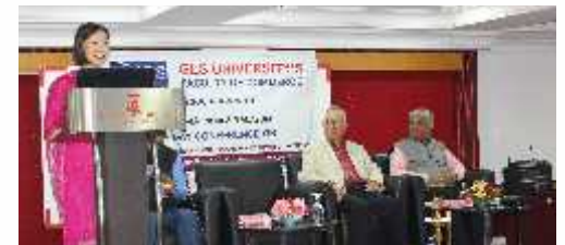
INTERNATIONAL CONFERENCE @ MALASIA