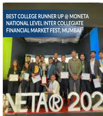
BEST COLLEGE RUNNER UP @ MONETA NATIONAL LEVEL INTER COLLEGIATE FINANCIAL MARKET FEST, MUMBAI