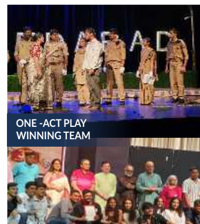
ONE -ACT PLAY WINNING TEAM