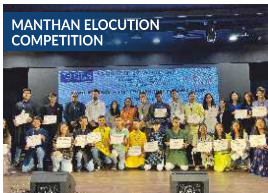
MANTHAN ELOCUTION COMPETITION