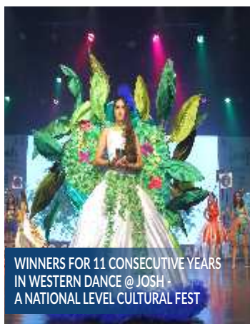
WINNERS FOR 11 CONSECUTIVE YEARS IN WESTERN DANCE @ JOSH - A NATIONAL LEVEL CULTURAL FEST