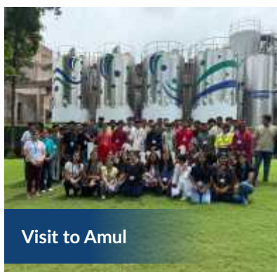
Visit to Amul