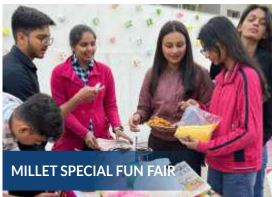
MILLET SPECIAL FUN FAIR