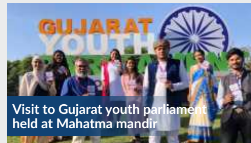
Visit to Gujarat youth parliament held at Mahatma mandir

Industrial visits at the Faculty of Commerce bridge the gap between theory and practice, offering students firsthand industry exposure. These visits enhance understanding, foster critical thinking, and develop problem-solving skills. Students gain insights into industry trends, interact with professionals, and build essential skills like communication and teamwork. They also expand their networks, connecting with potential employers. Committed to holistic education, FOC ensures students receive practical learning experiences that empower them to become confident, competent, and industry-ready professionals.