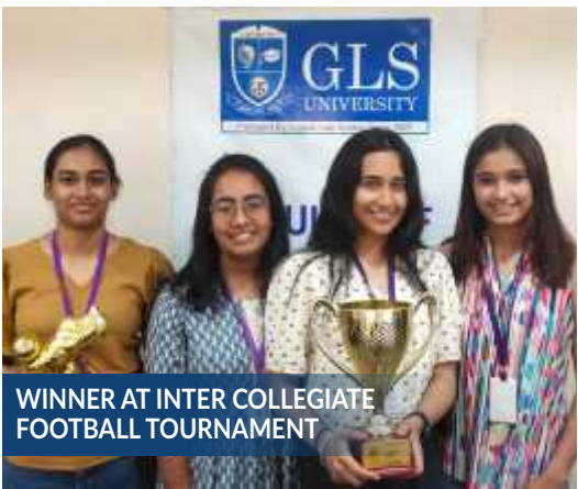
WINNER AT INTER COLLEGIATE FOOTBALL TOURNAMENT