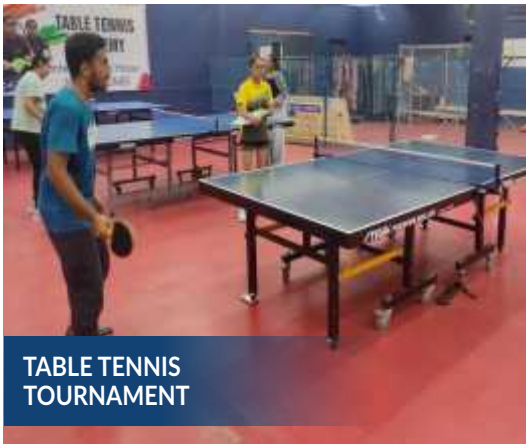
TABLE TENNIS TOURNAMENT