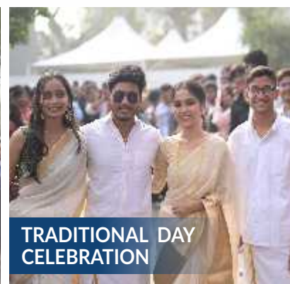
TRADITIONAL DAY CELEBRATION