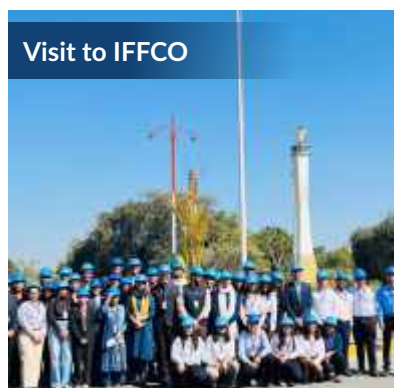
Visit to IFFCO