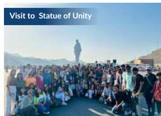
Visit to Statue of Unity