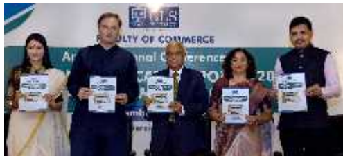
INTERNATIONAL CONFERENCE ON NATIONAL EDUCATION POLICY